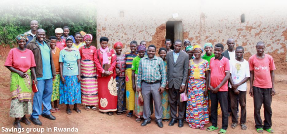
Savings group in Rwanda