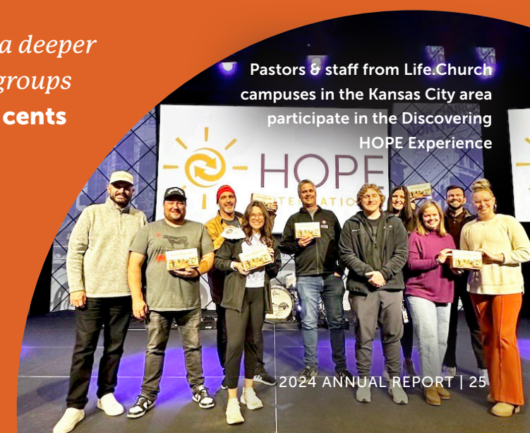
Pastors & staff from Life.Church campuses in the Kansas City area participate in the Discovering HOPE Experience

Learn how to bring the Discovering HOPE Experience to your church or small group on the back cover of this report.