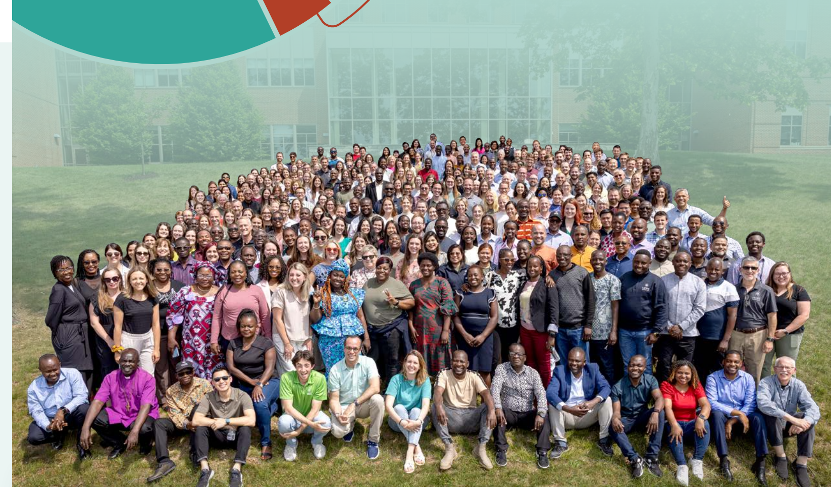
2024 Leadership Summit attendees