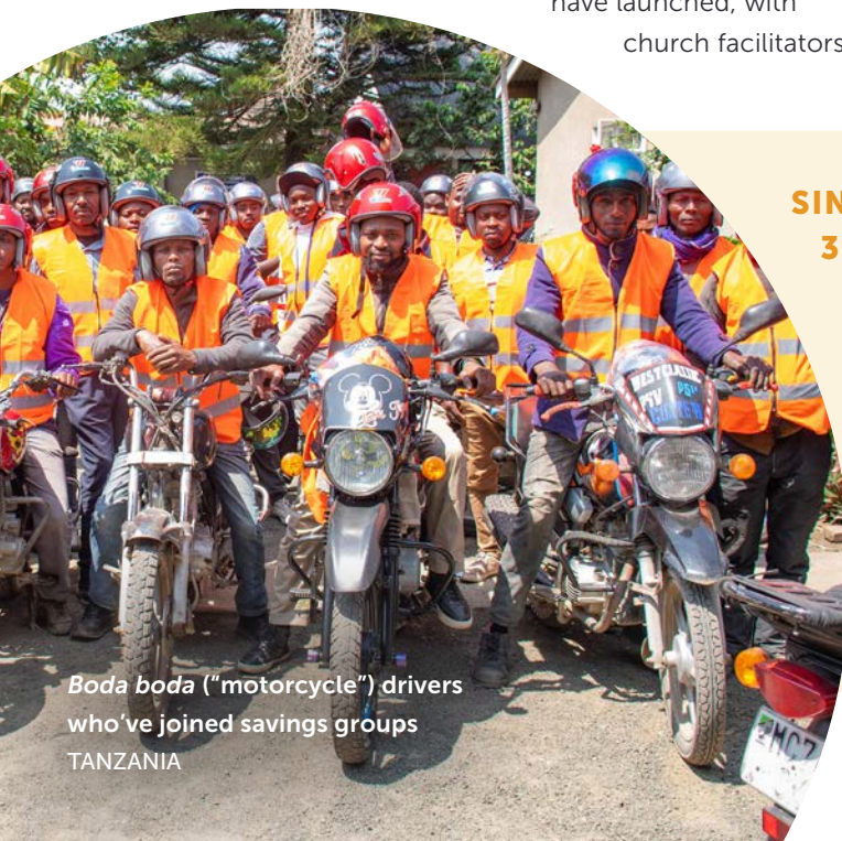
Boda boda ("motorcycle") drivers who've joined savings groups TANZANIA