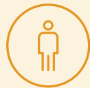
Isolation & loneliness

Poverty stifles dreams with obstacles like: