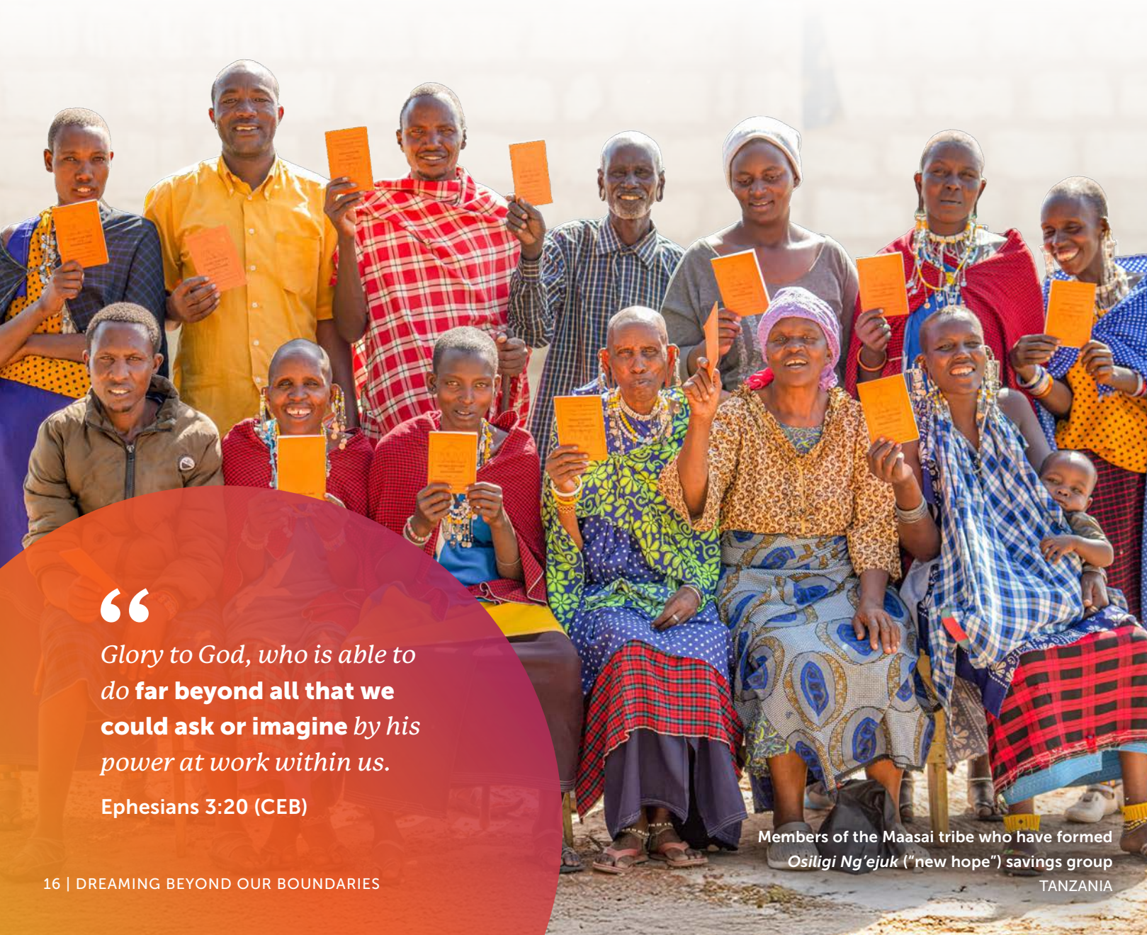
Members of the Maasai tribe who have formed Osiligi Ng’ejuk (“new hope”) savings group TANZANIA

We celebrate God’s work in 2024, bringing growth to three areas of priority: frontiers, innovation, and partnership.